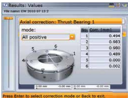
Thrust bearing correction screen

These allow quick and precise identification of turbine alignment condition.